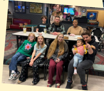
Bowling Night at Spencerport Bowl