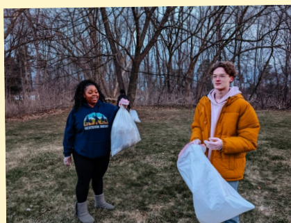
During their Lent series, the teens gave of their time to serve others and cleaned up the church yard.