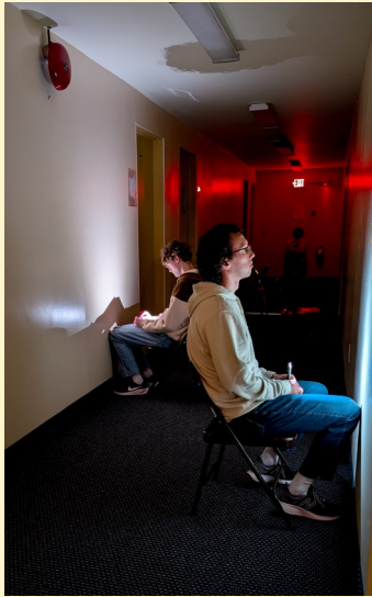
Prayer session at eth start of the series exploring what it means to rally be a Christian.