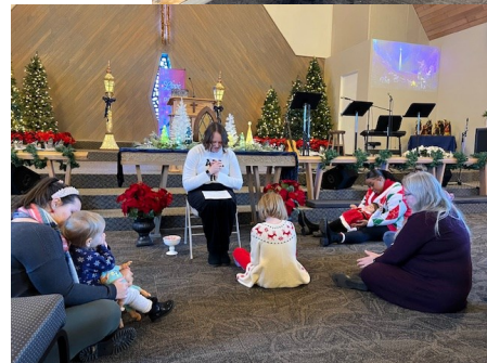
Christmas Children's Message