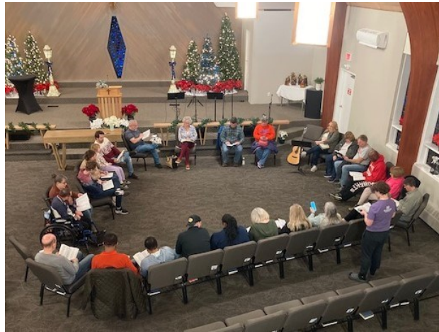
November prayer night

Watch for a new prayer section in the Monday email. It will list ongoing prayer needs. Prayer requests will continue to be sent through the prayer chain when they are received. If you would like to receive prayer chain emails, please contact the office.